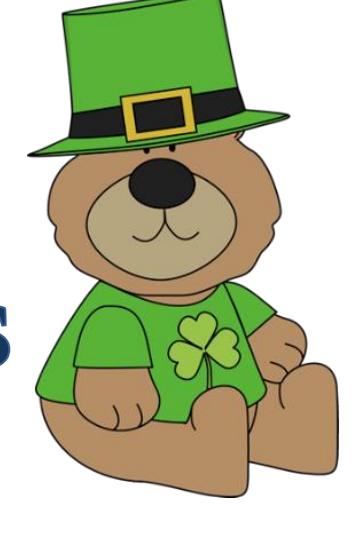
Half Step or Whole Step